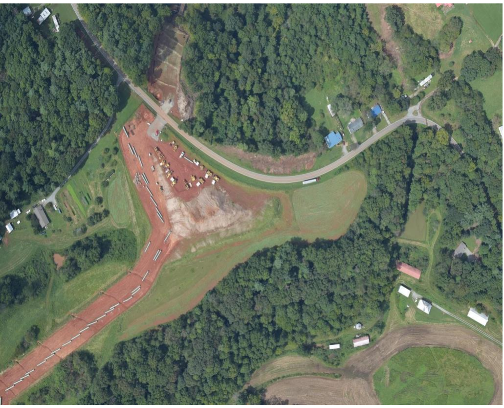
Figure 1 - Aerial image of the Angle property September 18, 2018.

The aerial photo of the Angle farm below shows areas of <u>bare soil present since</u> <u>at least September 2018</u>.