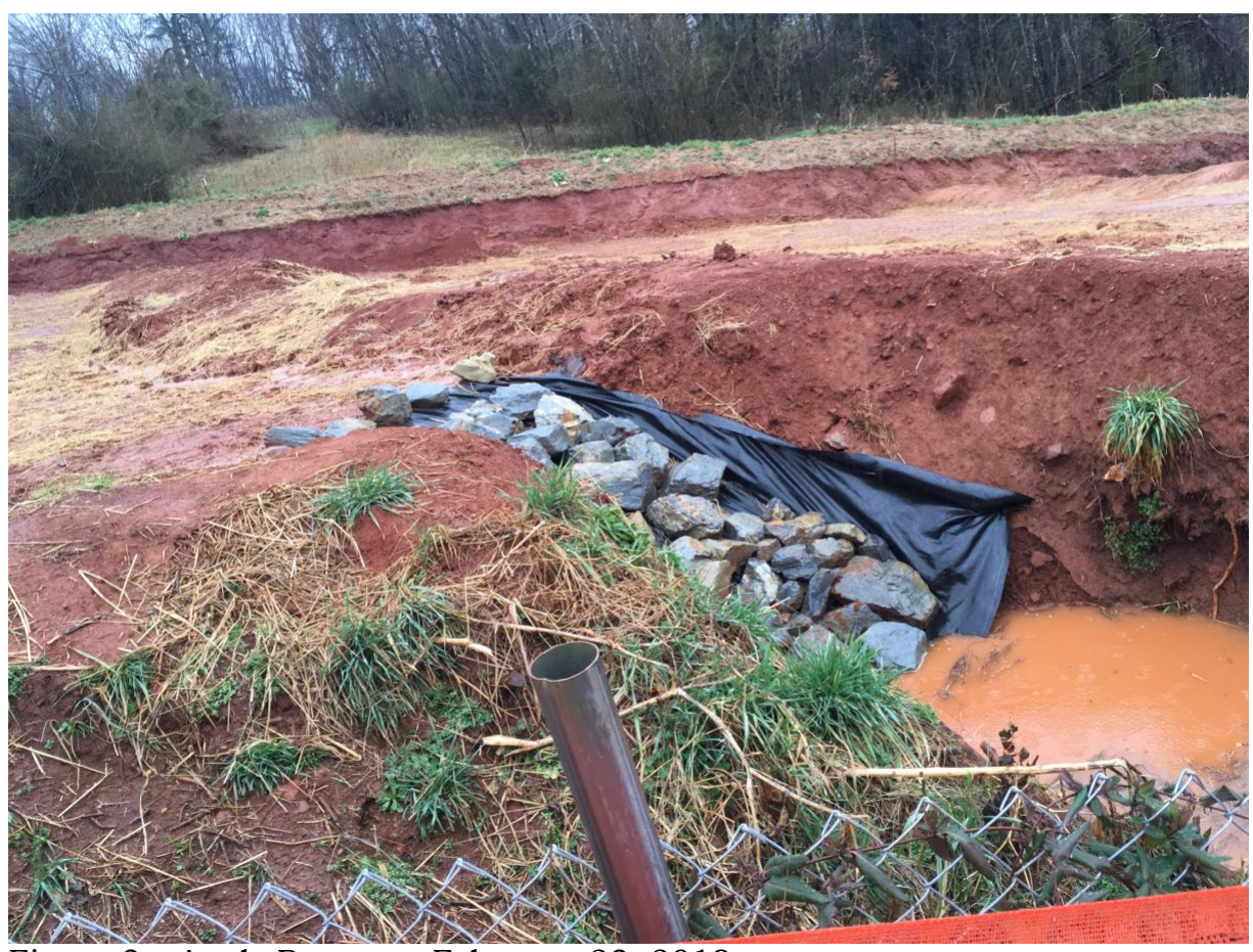
Figure 3 – Angle Property, February 23, 2019

The photo below shows significant sections of bare, unstabilized soil that has been in that condition for around 4 months, since October 2018. In the foreground is a "water bar" which is intended to channel water across the right-of-way to the settling basin seen in the lower right corner. Note that this water diversion structure is itself unstabilized and contributing eroded soil to the flows leaving the site.