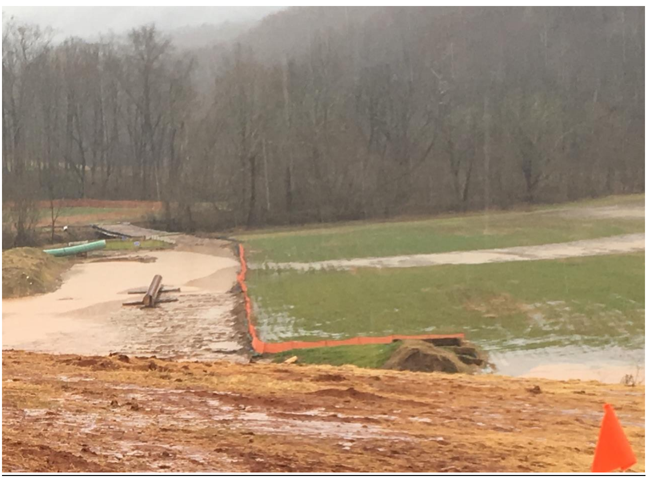
Figure 7 – Angle Property, February 23, 2018

Below is a close-up of a section of Figure 2 above. Here you can see sediment-laden water flowing from the impounded area onsite, through an outlet in the perimeter silt fence on the right, and across the Angle's property in a plume that discharges to the Blackwater River in the far-ground.