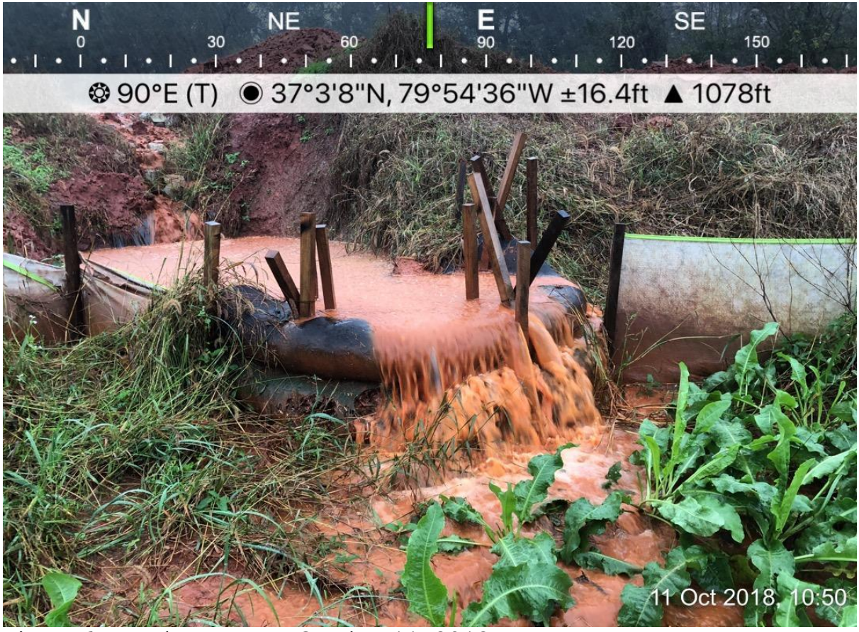
Figure 6 – Angle property, October 11, 2018

Another gross failure of an outlet protection structure.