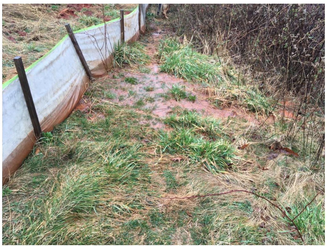
Figure 4 – Angle Property, February 23, 2019 (muddy water flowing under silt fence)

"Perimeter controls," such as the white silt fencing seen below and other methods, are supposed to stop sediment from flowing out of the work area. The photo below, taken last weekend, shows one of a number of instances where the silt fence is failing