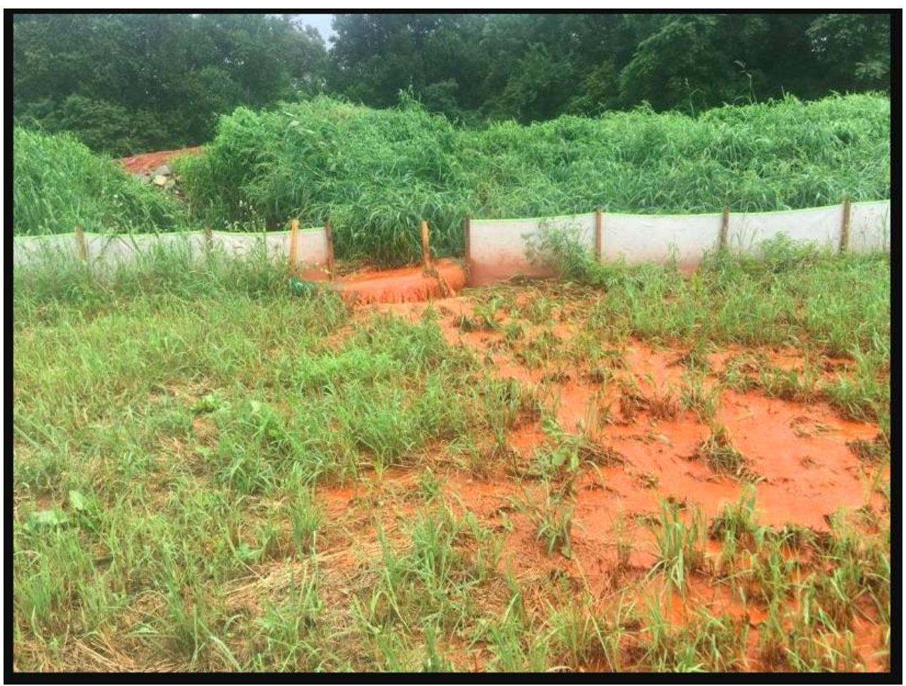
Figure 5 - Angle Property, August 3, 2018 (outlet from water bar failing)

Below is a failure of an outlet protection structure.