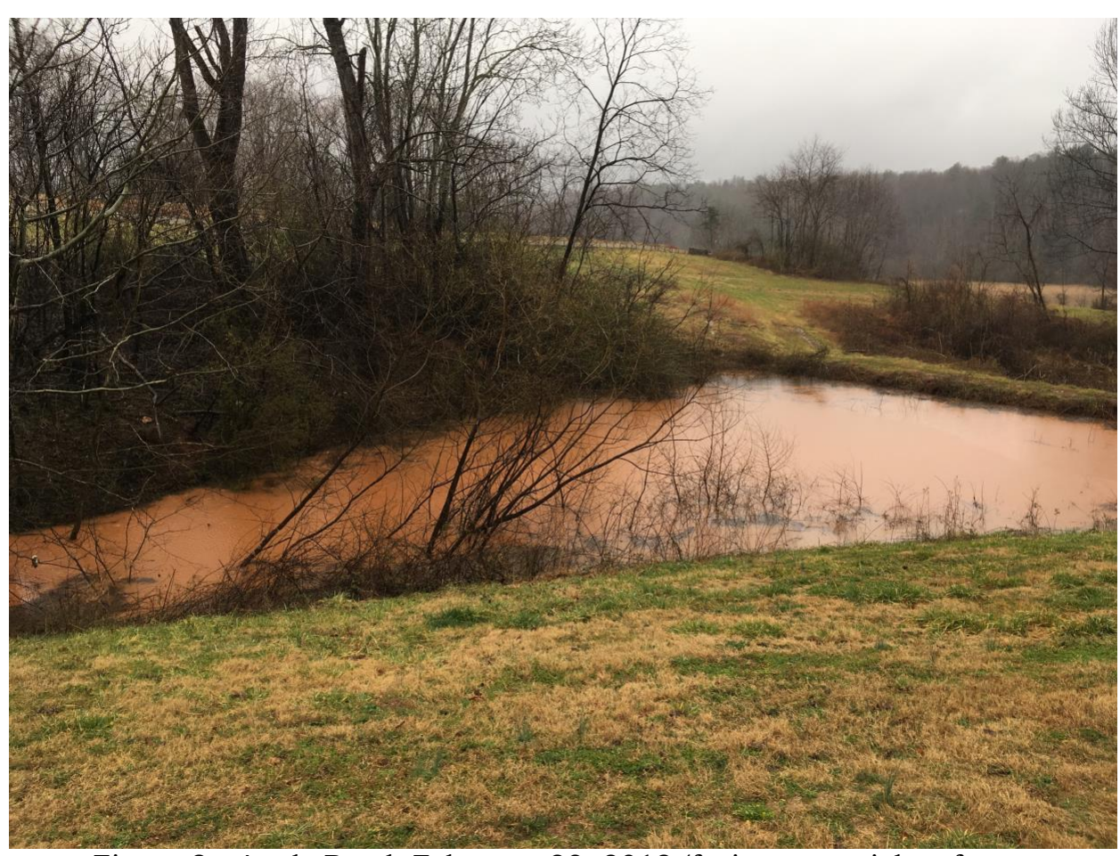
Figure 9 - Angle Pond, February 23, 2019 (facing east, right-of-way upslope in the background)

Some of the sediment flowing from the MVP work site has flowed down the slope off the west side of the right-of-way and into the Angle's pond and the intermittent stream that feeds it. This sediment pollution is a violation of water quality standards which will be long-lasting.