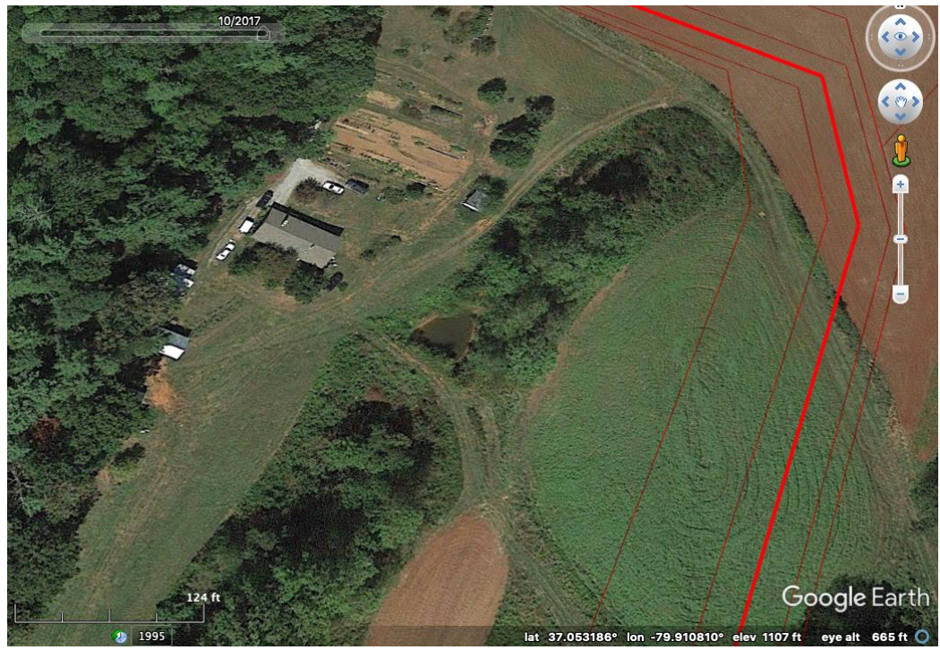
Figure 10 - Angle Property and pond, October 2017 (right-of-way in red)

For comparison to the view above, here are two historical views of the Angle's pond from Google Earth. The first just months before MVP construction began and the other eight years ago.