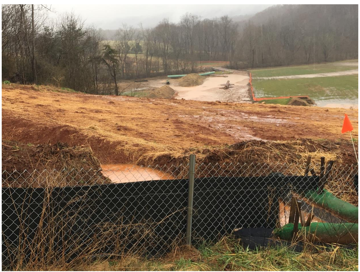
Figure 2 - Angle property, February 23, 2019

As shown in the photo below, much of the site remains bare to this day and the soils are still not stabilized, despite the fact that the pipe was installed and most of the trench covered in October 2018. While some straw is spread across the surface in the foreground, the portions in the floodplain below are entirely bare and parts are covered by a significant body of standing water.