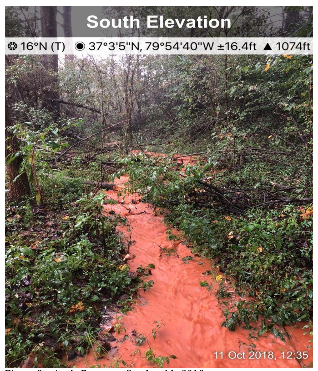
Figure 8 - Angle Property, October 11, 2018

Sediment flowing from the work site flows across residents' land and into their streams and wetlands, when not controlled in accordance with the certification.